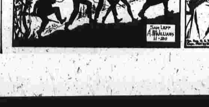
BY LEFF AND McWILLIAMS