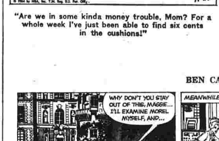
BY FRANK O'NEAL