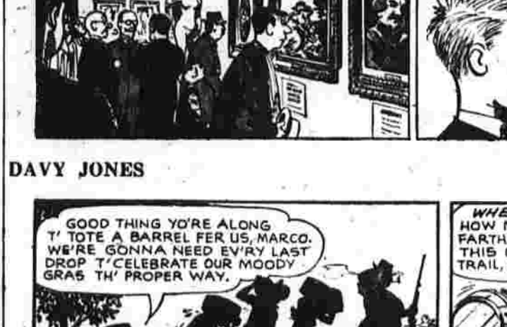
BY LESLIE TURNER