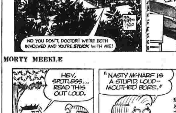
BY LANK LEONARD